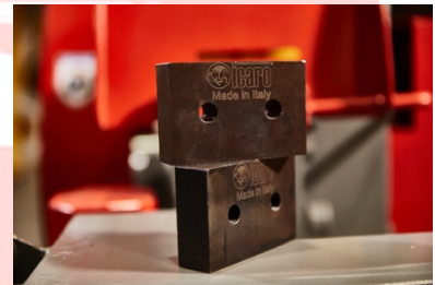
Steel blade set