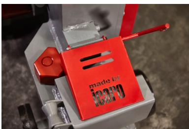
C.E. cutting protection